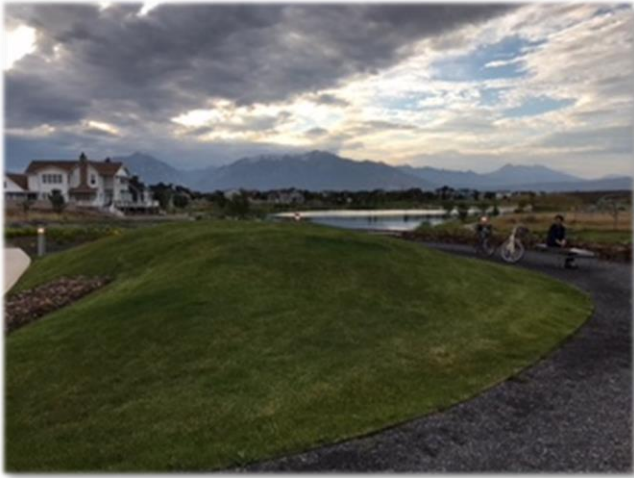
Location #1 - Wattery Way and Isthmus Place